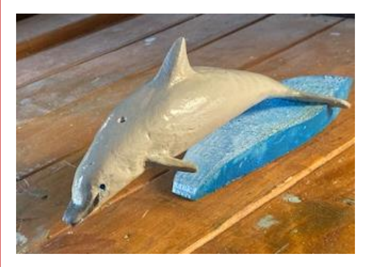
Keith Baily carved this dolphin and mounted it on a stand. Nicely painted in blue and grey.